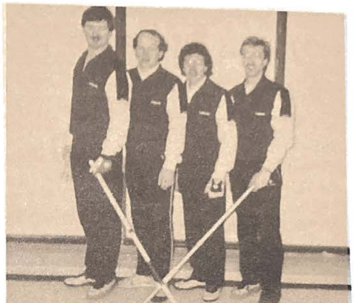
MEN'S ZONE WINNERS