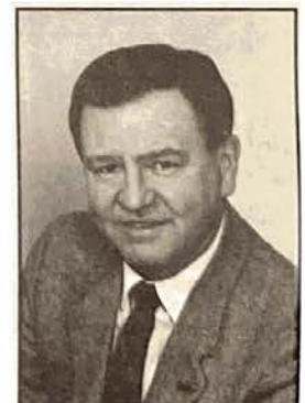
1997 Silver Award Winner