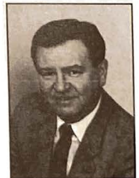
1997 Silver Award Winner