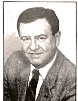
1997 Silver Award Winner