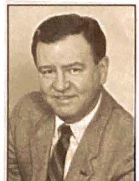
1999 Silver Award 1997