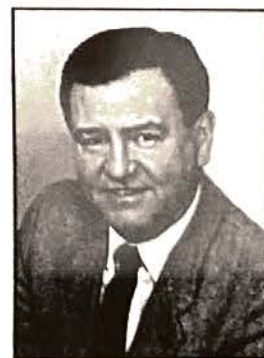
1997 & 1999 Silver Award Winner